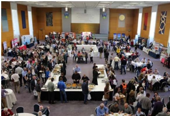
→ Delegates attending the UCD Veterinary Hospital Conference