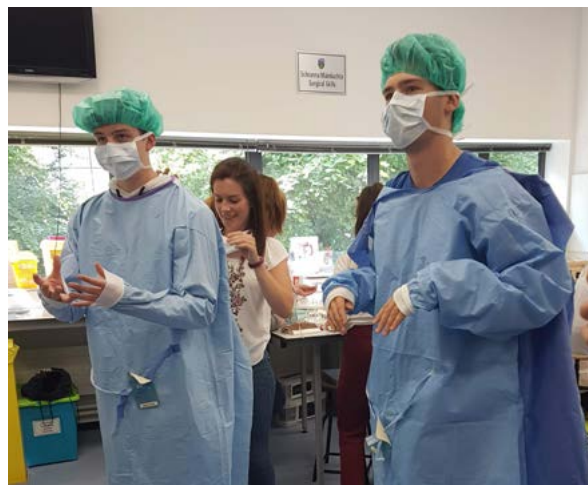
→ Summer School students learning some key veterinary skills in our Clinical Skills Centre

This year's students were paired with undergraduate vet student mentors, and they attended a series of talks from our lecturers and residents across the week they were in UCD. They also had the opportunity to attend practicals, a postmortem and get hands-on practice in our Clinical Skills Centre. We organised trips for the group to The National Stud, Troytown Greyabbey Equine Veterinary Services, UCD Lyons Farm and Dublin Zoo, so that they could see how Veterinary Medicine is practiced or taught in each of these places.