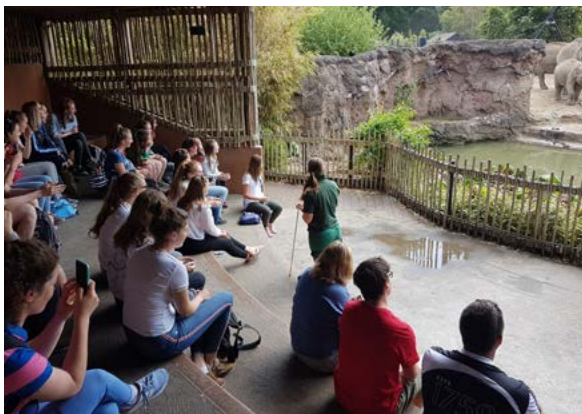
→ Summer School students attend a talk at Dublin Zoo

This year's students were paired with undergraduate vet student mentors, and they attended a series of talks from our lecturers and residents across the week they were in UCD. They also had the opportunity to attend practicals, a postmortem and get hands-on practice in our Clinical Skills Centre. We organised trips for the group to The National Stud, Troytown Greyabbey Equine Veterinary Services, UCD Lyons Farm and Dublin Zoo, so that they could see how Veterinary Medicine is practiced or taught in each of these places.