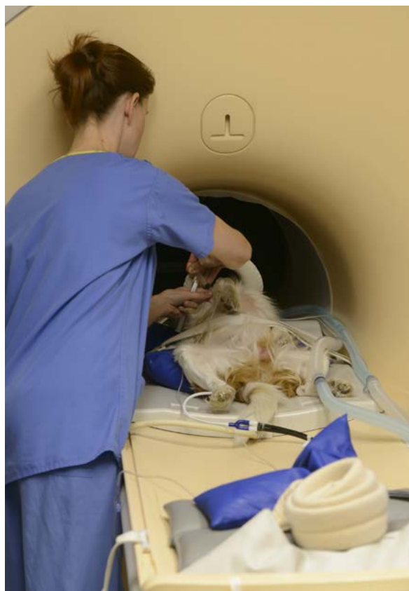
→ An MRI being carried out in the UCD Veterinary Hospital

With sedation in place of general anaesthesia, these patients can go directly for treatment and may also be discharged in a more timely fashion.